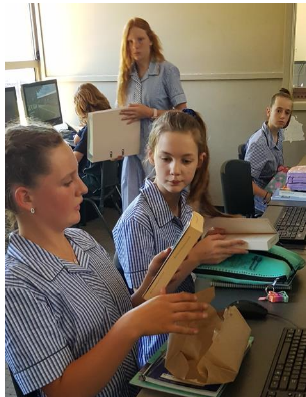
Year 7 students enjoying a mystery book activity